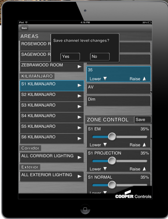
The iLumin™ mobile app shown here on an iPad.