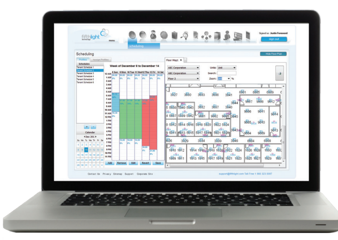
The Fifth Light Lighting Managment Software (LMS).