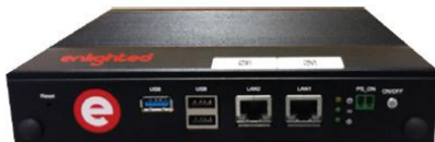
LumaWatt Pro Energy Manager

The data points are published over BACnet/IP server at every five to 15-minute intervals. Bacnet enablement of user interface will be completed and defined with onsite commissioning.