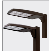
PRV / PRV-XL Prevail Discrete