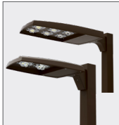
PRV / PRV-XL Prevail