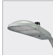
ARCH-M Archeon Medium