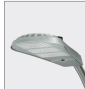
ARCH-L Archeon Large