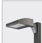
GAP Galleon Pedestrian