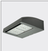
GWC Galleon Wall