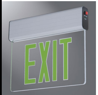
EUS Series (Surface Edgelit)