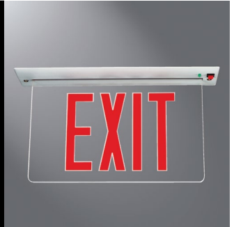
EUR Series (Recessed Edgelit)