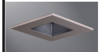
3011SNBB Satin Nickel with Black Baffle