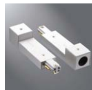
L989 Conduit Continuation Kit