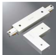
L943 Straight/L Connector