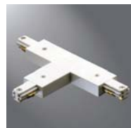
L945R Right T Connector