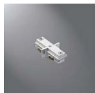
L949 Mini Joiner