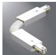
L942 Flex Joiner