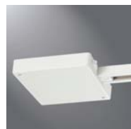
LC941 Current Limiter