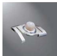
L983 T-Bar Attachment Clip