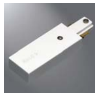
L941 Live End Connector