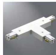
L945L Left T Connector