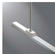
L951 Wire Way Cover for Pendant Assembly Kit