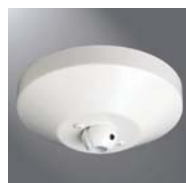
L994 45° Pendant Adapter

Specifications and dimensions subject to change without notice. Consult your Cooper Lighting Solutions Representative or visit www.cooperlighting.com for available options, accessories and ordering information.