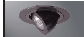
1496TBZ Tuscan Bronze Elbow