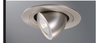
1496SN Satin Nickel Elbow