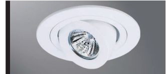
1496P White Elbow

*UL1993 listed LED & CFL equivalent lamps permitted. Consult lamp manufacturer for conditions of use. Cooper Lighting Solutions does not warranty the lamp.