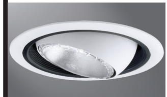
420P White Eyeball & Black Baffle, White Trim