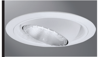
420W White Eyeball & Baffle, White Trim