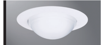
172PS White Trim, Dome Lens with Reflector