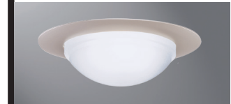
172SNS Satin Nickel Trim, Dome Lens with Reflector