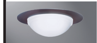
172TBZS Tuscan Bronze Trim, Dome Lens with Reflector