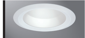
6121WH White Reflector, White Trim

Compatible with Halogen, Incandescent, LED* or CFL* lamps.