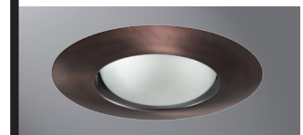
5176TBZ Tuscan Bronze Trim