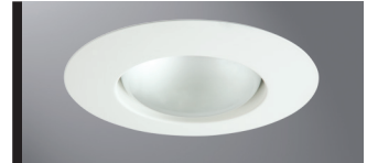
5176WH White Trim

Compatible with Halogen, Incandescent, LED* or CFL* lamps.