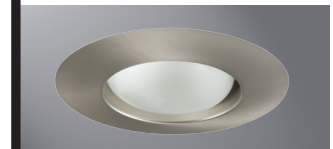
5176SN Satin Nickel Trim