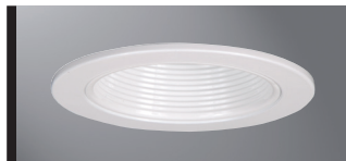
4013WB White Baffle, White Trim