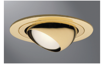
998PB Polished Brass Trim with Polished Brass Eyeball