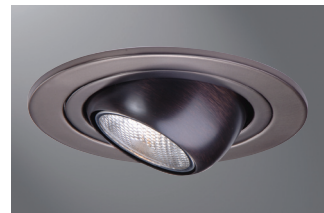
998TBZ Tuscan Bronze Trim with Tuscan Bronze Eyeball