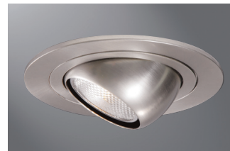
998SN Satin Nickel Trim with Satin Nickel Eyeball