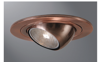
998AC Antique Copper Trim with Antique Copper Eyeball