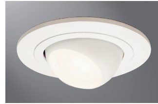
998P White Trim with White Eyeball