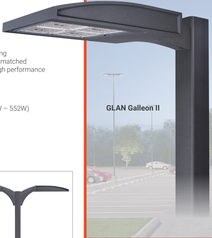
GLAN Galleon II

Better efficacy, improved thermal management for superior reliability