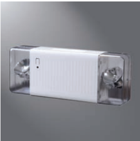
PC1-10 CONTOURS EMERGENCY LIGHT

Compliances may not apply to all product configurations. Please consult the product spec sheet for compliance details. COMPLIANCES: UL924 Listed; Damp Location