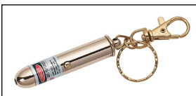
Laser tester Part Number=LASER (sold separately)