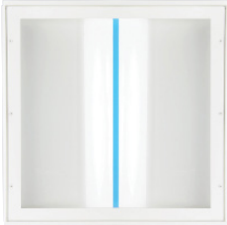
STRT/BL = Thin Stripe, Blue BL=BLUE BK=BLACK RD=RED