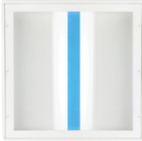
STRM/BL = Medium Stripe, Blue BL=BLUE BK=BLACK RD=RED