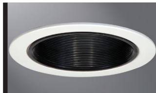
5012 White Trim, Black Baffle

Height: 3-1/2" [89mm] Outside Diameter: 6-3/8" [162mm]