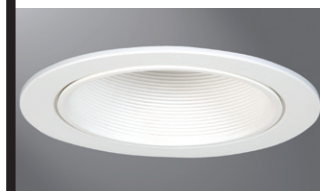
5012W White Trim, White Baffle